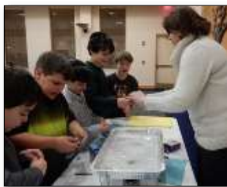
Braiding Havdalah candles