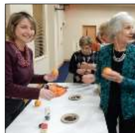
Adding cloves to oranges for Havdalah spice