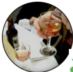
Adding red to white as the season change.