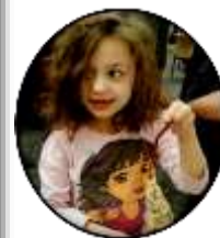
Look at my bird feeder!