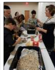
Bird Feeders with ice cream cones, peanut butter & seeds