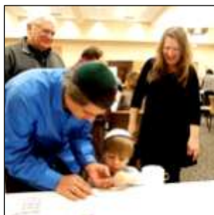
Decorating a laver- my hand-washing cup.