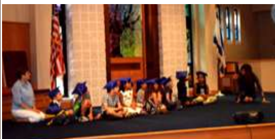
The graduating 4 year-old Dinosaurs

We now are looking forward to our Summer Fun program. We will be offering lots of science, art and nature projects - and lots of sprinkler and pool fun too!