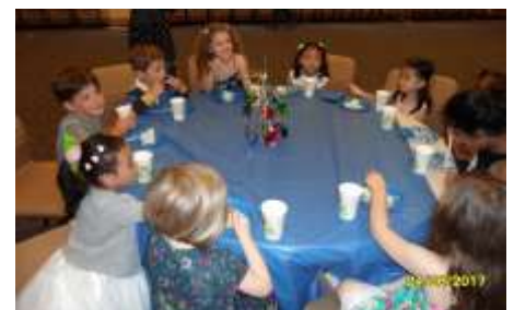
Celebrating with friends