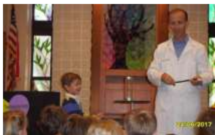
The magic show